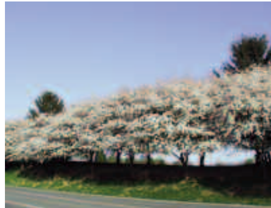
trees that are treated for apple scab will continue to thrive and add value to the landscape