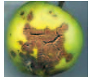
scab symptoms on fruit

Susceptible Hosts: Malus species, including apple fruit trees and flowering crabapples