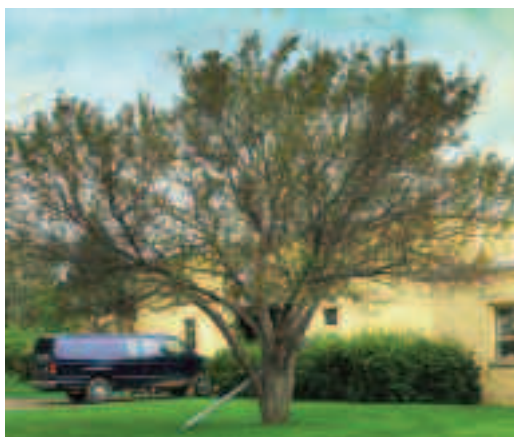
infected apple trees will begin to defoliate in midsummer leaving a thin or weak appearing canopy